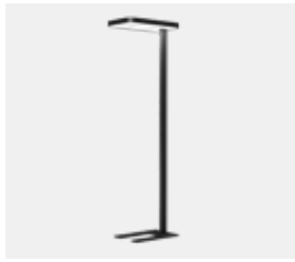
matt black (RAL9005)