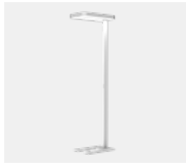
matt white (RAL9016)